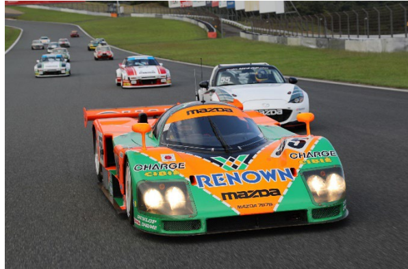
Mazda 787B parading alongside historic Mazda models (2018, Be a Driver. at FUJI SPEEDWAY)

Mazda will continue to cherish “the joy of driving” and “challenger spirit,” delivering experiences that pass these values on to the next generation.