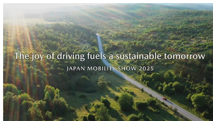
Mazda’s Exhibition Theme: “The joy of driving fuels a sustainable tomorrow”

Mazda’s exhibition theme is “The joy of driving fuels a sustainable tomorrow.” Toward the year 2035 when there will be technological innovations and much advanced social infrastructure, Mazda aims to contribute to a bountiful planet while responding to people’s passion for cars and driving, and their desire to enjoy driving for as long as possible. Mazda envisions a world that harmonizes a sustainable society with uplifting experiences through the joy of driving.