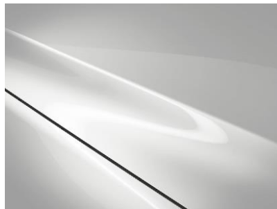
Rhodium White Premium

Mazda believes color is a crucial part of what gives shape to a vehicle, and thus we are focusing efforts on developing colors that accentuate a dynamic and delicate expression via the Kodo - Soul of Motion design theme. Rhodium White Premium is a pure white inspired by Japanese aesthetics finding beauty in simplicity and the absence of superfluous elements. Furthermore, the paint's fine grain accentuates the shadows on the surface of the vehicle complimenting the metallic texture of Rhodium White Premium.